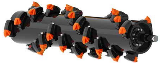
Fixed tooth 30cm Ø