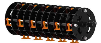
FR rotor 25cm Ø