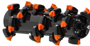
Fixed tooth 25cm Ø