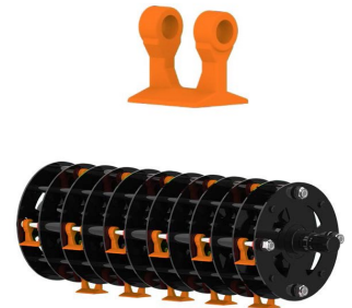
FR rotor 12cm Ø