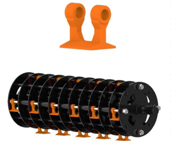
FR rotor 12cm Ø