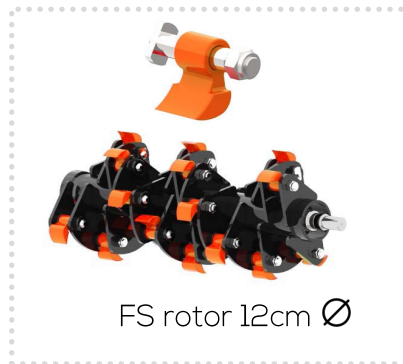
FS rotor 12cm Ø